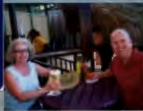
2014 Dudley ~ Music City Bop